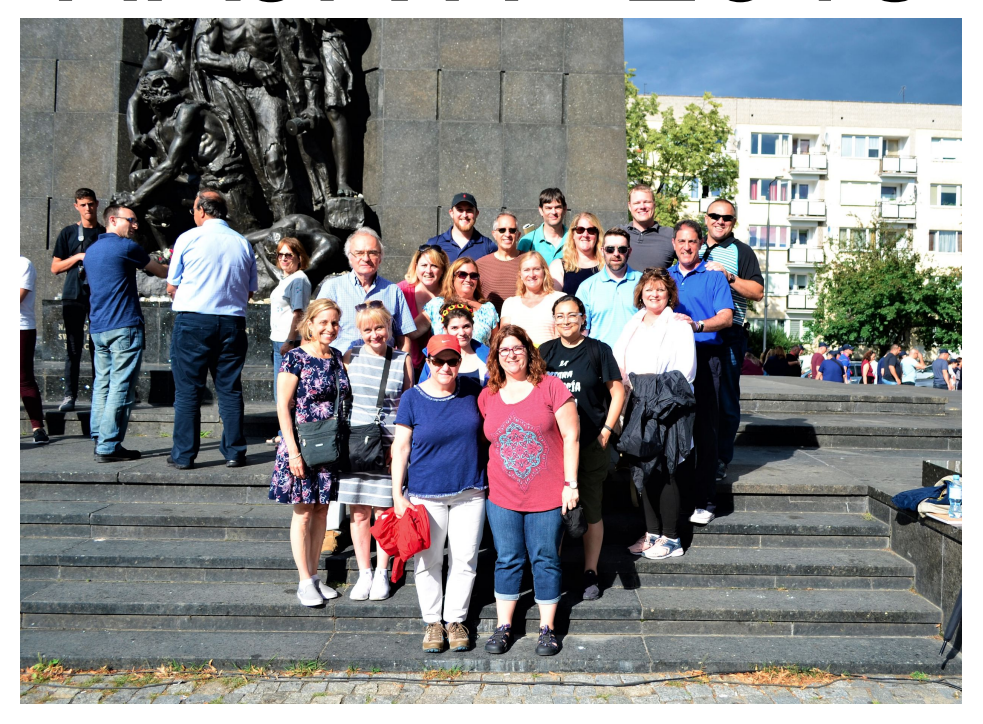
Holocaust and Jewish Resistance Teachers Program June 26- July 10, 2018 Germany and Poland